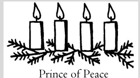
Prince of Peace

Christmas Eve Candlelight Service @ 7 pm