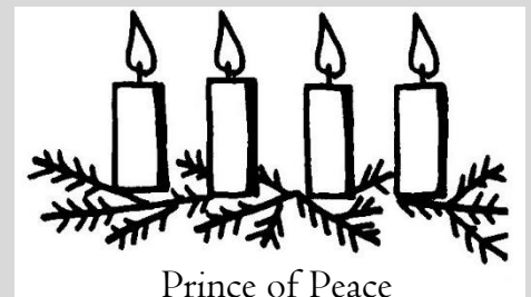
Prince of Peace

Christmas Eve Candlelight Service @ 7 pm